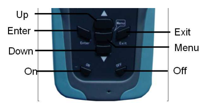
Figure 2, Button functions