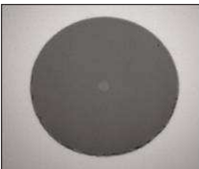
Figure 1. Connector end face, singlemode fiber, viewed under coaxial illumination, x400. Note small core in the middle.