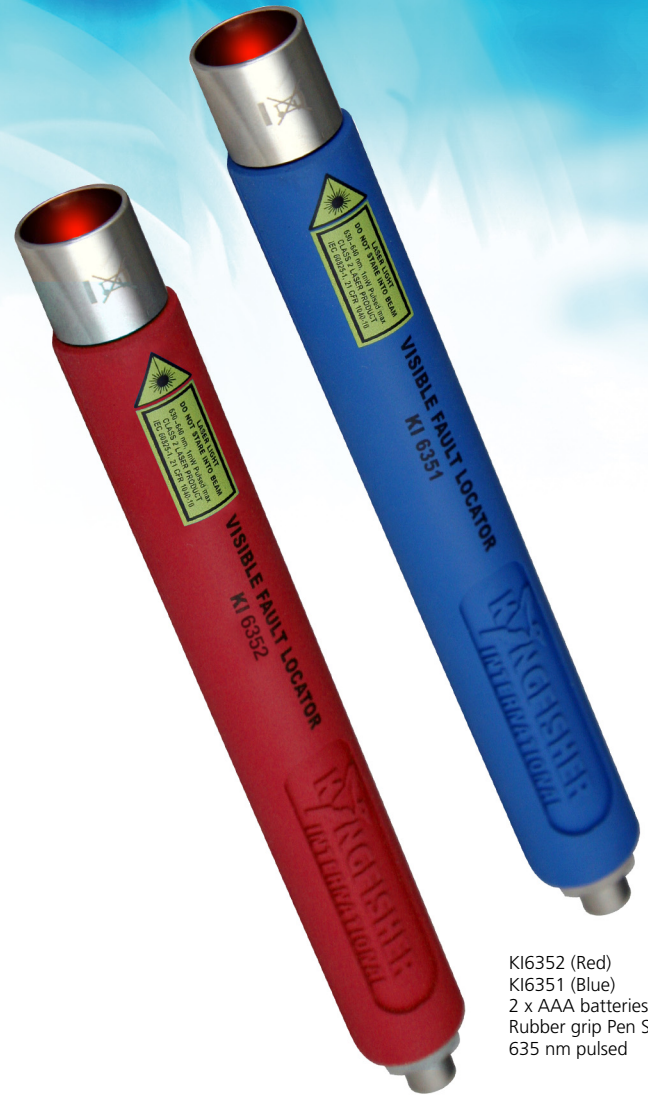
KI6352 (Red) KI6351 (Blue) 2 x AAA batteries Rubber grip Pen Style 635 nm pulsed